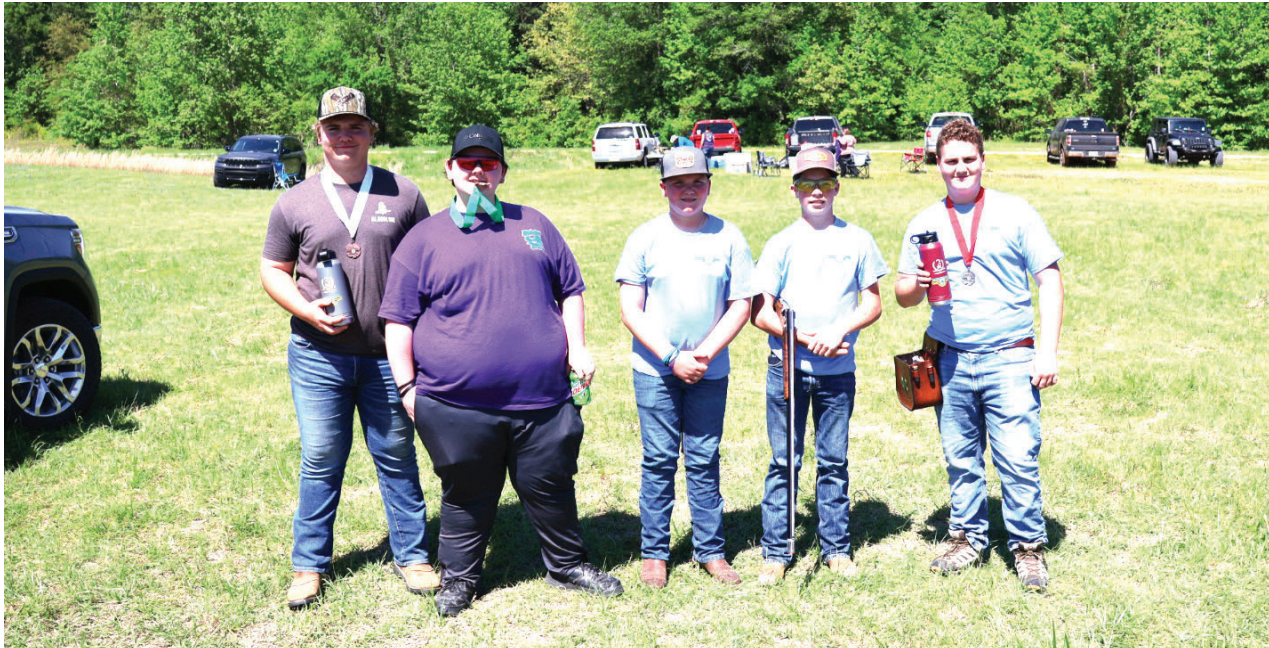
Members of Webster Parish 4-H Shooting Sports competed against competitors from across the state in a variety of shooting sports competitions bringing home a total of 43 medals over the course of the week.