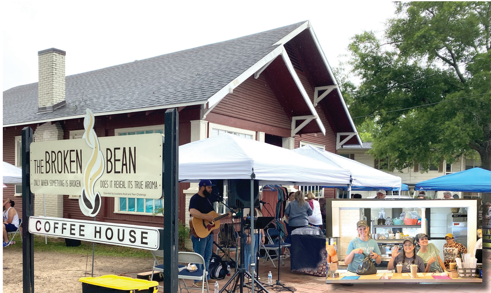
The Broken Bean coffee shop celebrated its 6th anniversary on Saturday with music, face painting, and many other fun activities.