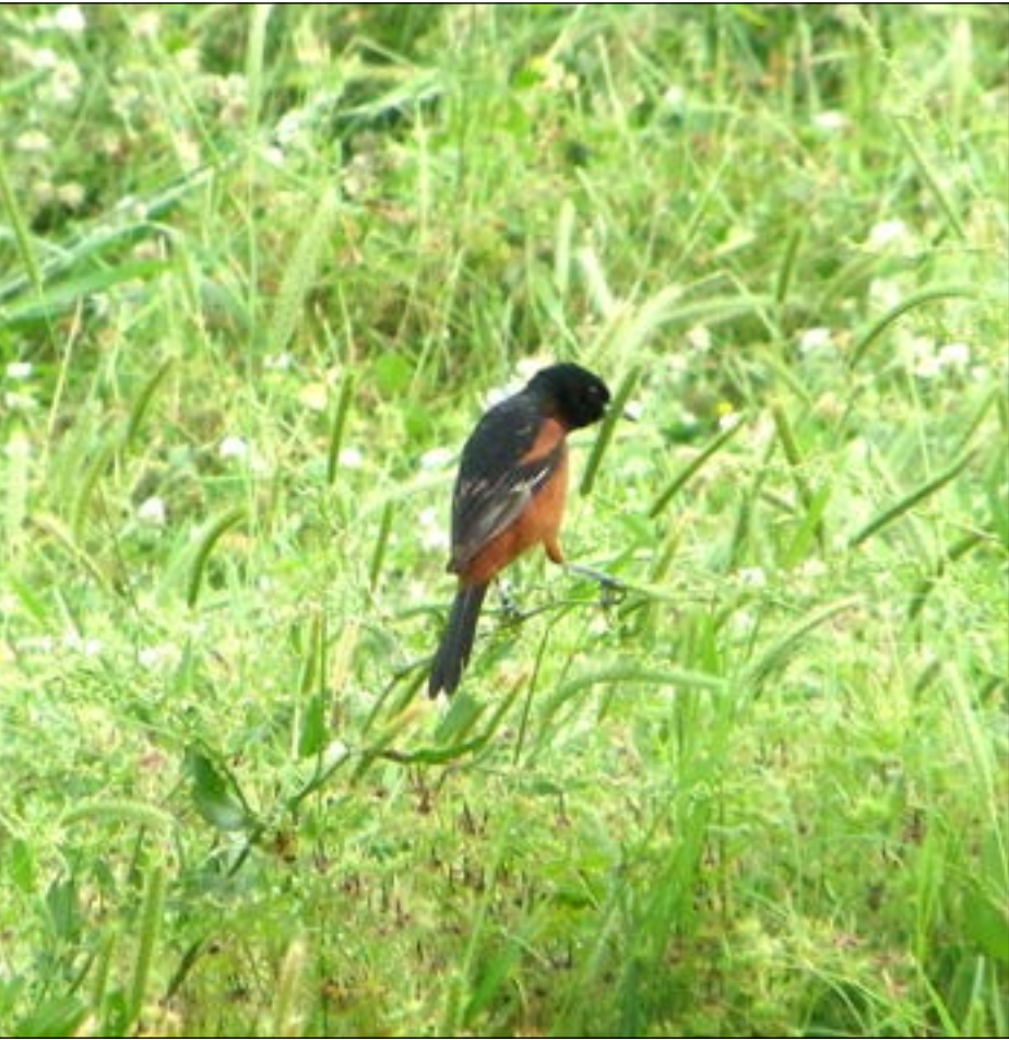
CARLA JOHNSTON The orchard oriole is a beautiful little bird that deserves protection from boys with BB guns.

I grew up during an age when if you lived out in the country and you were a boy, you bird hunted. Starting out with a double-barreled sling shot made from a forked branch, two strips of rubber cut from an inner tube and a square of leather cut from a shoe tongue to hold a rock, we spent long summer days bird hunting. There were very few species that were off-limits to us. Orioles,