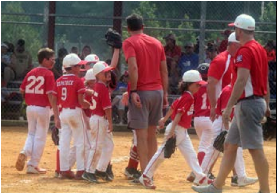
A Ruston all-star squad was one of 58 teams that competed in the Minden Dixie St. Jude Open.

The rest were from the surrounding area including Springhill, Ruston, Benton, Bossier City and Shreveport.