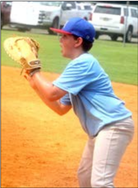
The Minden 12U All-Stars played Jackson Parish Saturday in the Minden St. Jude Dixie Open on Saturday at the Minden Recreation Complex. Sunday's action was rained out.