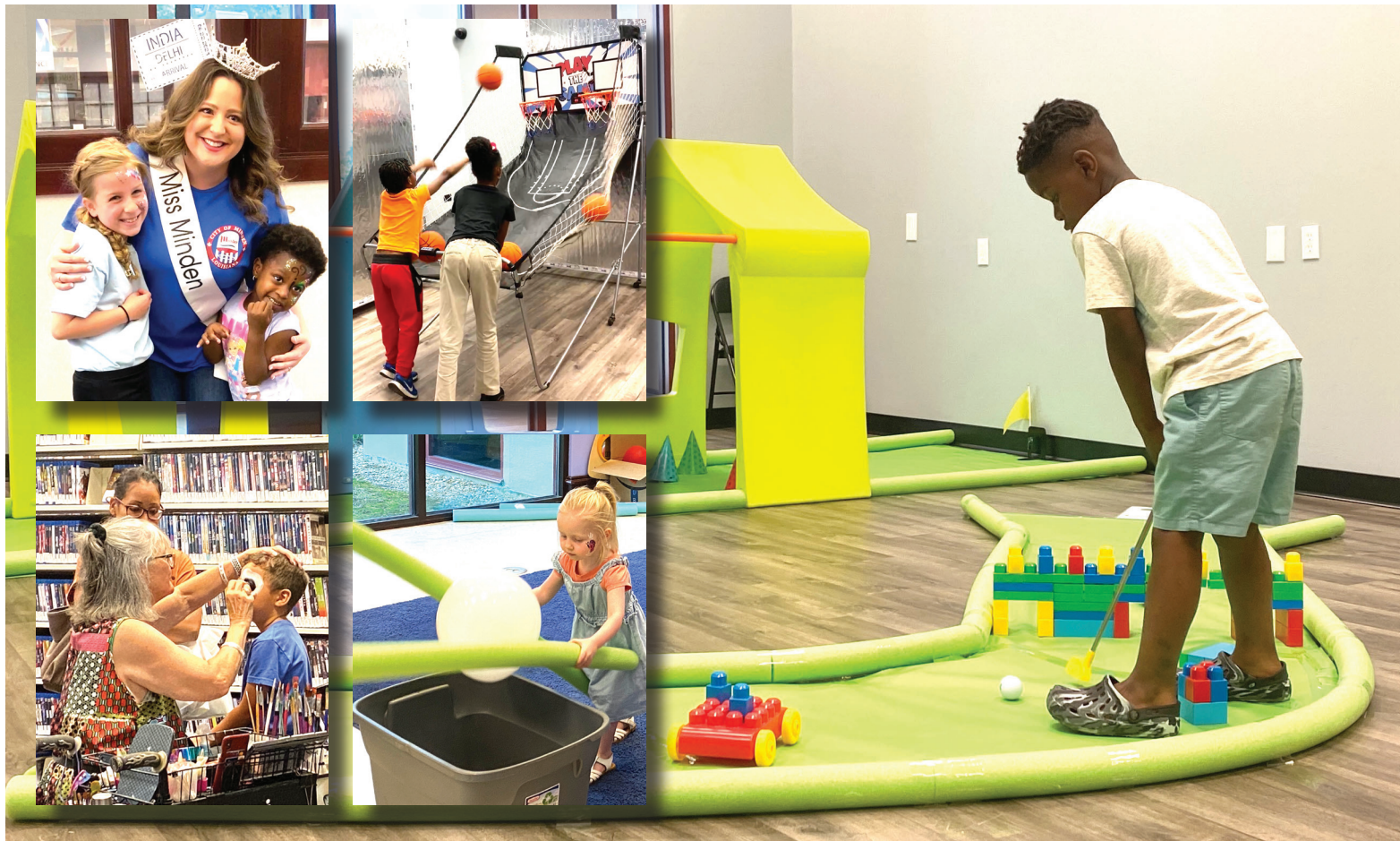
Kids “traveled the world” at the kick off of the Webster Parish Libraries’ Summer Reading Program.