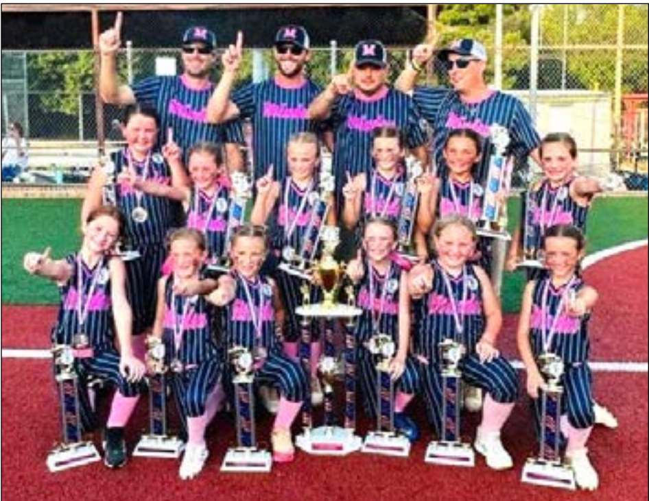
The Minden Darlings All-Stars qualified for the 8U World Series in Fairview, Tenn., by winning the state tournament in Tioga.