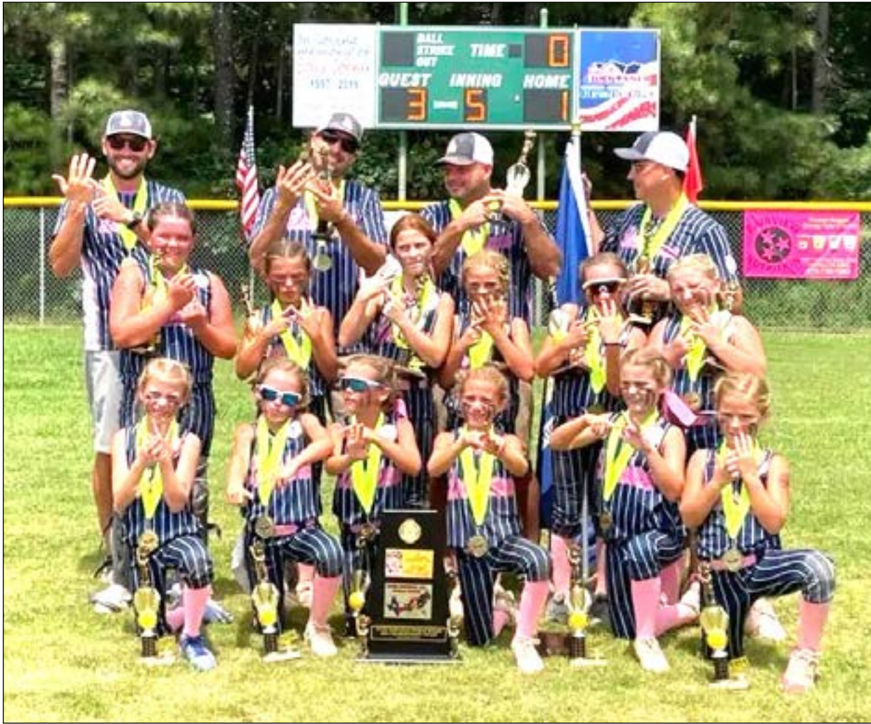
The Minden Darlings All-Stars won the 8U World Series last week in Fairview, Tenn.