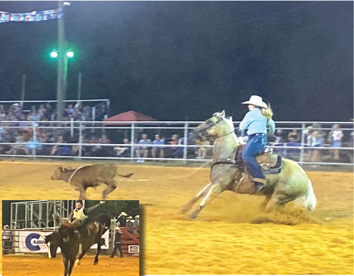
The 3rd Annual Pete Colvin Memorial Rodeo was a resounding success featuring athletic feats by some of the finest rodeo talents in the region. The show included everything from bull riding to barrel racing and even a trick riding performance.