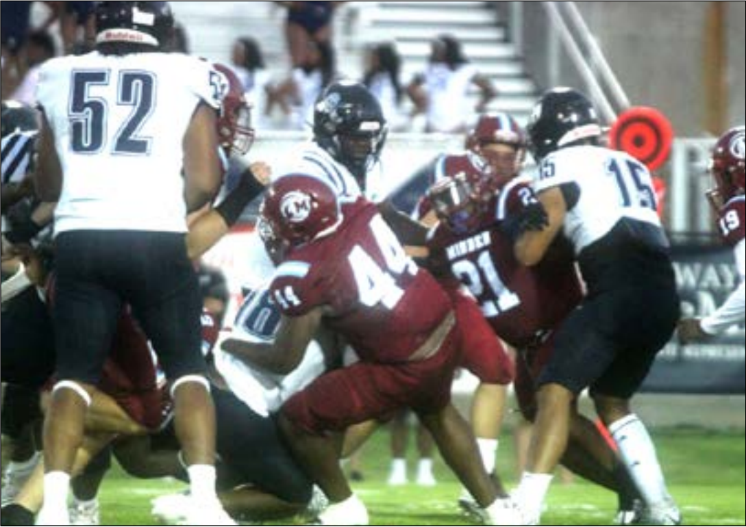
The Minden defense turned in a solid performance in a 32-16 loss to Huntington.