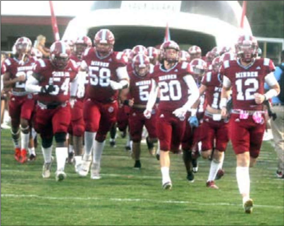
The Minden Crimson Tide take the field before last Friday's Homecoming game.