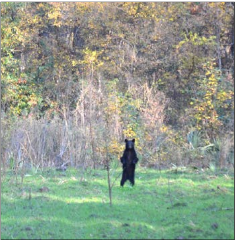
This black bear stood up to observe this writer determined to take his photo.