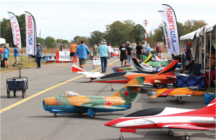
The SHARKS R/C Jet Rally treated spectators to an exhibition of radio-controlled jet aircraft this past weekend at the Minden Airport.