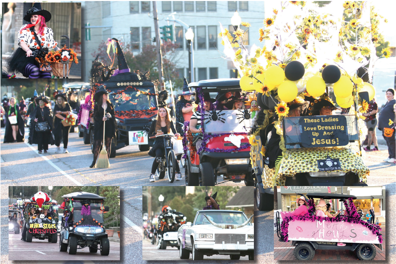
The inaugural Witches Ride of Minden captivated spectators with a bewitching display of spooky, festive attire last Thursday. Proceeds from this event will benefit the nonprofit organization WeCare and support enhancements at Miller Quarters.