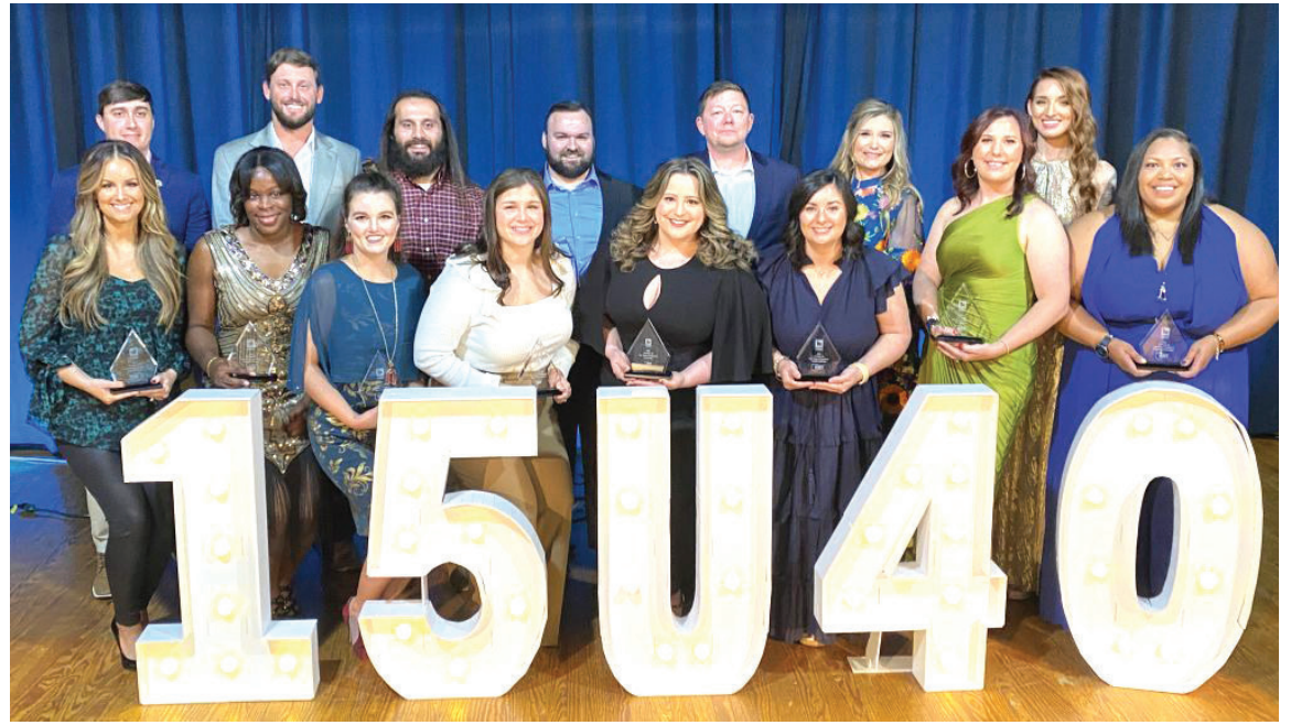
Class of 2023 15 under 40.

can talk to us about anything. We gain their trust, and they can look at us without being like, 'oh, there's the po-po.' Some people have bad judgment about law enforcement and just see us as bad, but being here with us every day lets them learn more about us and we learn about them. They learn to trust us; we build trust."