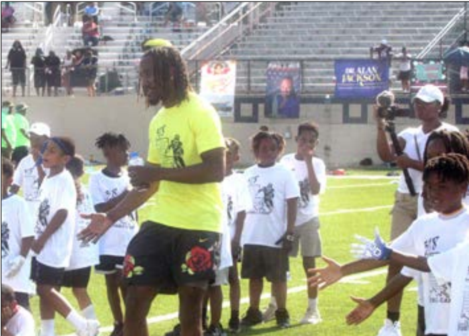
Former Minden High and Louisiana Tech star L’Jarius Sneed participated in the 318 Takeover Youth Camp at Independence Stadium in June after helping the Kansas City Chiefs win Super Bowl LVII

College during the summer. As of this writing, he had played in 10 games and was averaging 8.5 points despite averaging just 4.7 minutes of playing time.