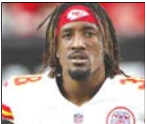
L’Jarius Sneed FILE PHOTO

Former Minden and Louisiana Tech star L’Jarius Sneed has been in the NFL for just four seasons. Sunday the Kansas City Chiefs cornerback will be playing in his third Super Bowl. The Chiefs take on the San Francisco 49ers in Super Bowl LVIII at Allegiant Stadium in Las Vegas. Kansas City is looking to repeat after defeating Philadelphia 38-35 in last year’s game. Kickoff is 5:30 p.m. (CBS). If not for Sneed, the Chiefs might not even be playing Sunday. He made one of the biggest plays in the Chiefs’ 17-10 AFC Championship Game victory over Baltimore on Jan. 28. On the first play of the fourth quarter and Baltimore facing a second-and-8 at the Kansas City 9, Lamar Jackson completed a pass to Zay Flowers. Just before Flowers crossed the goalline Sneed slapped the ball out of Flowers’ hands. Sneed’s teammate Trent McDuffie recovered it in the end zone for a touchback. “He had a step on me,”