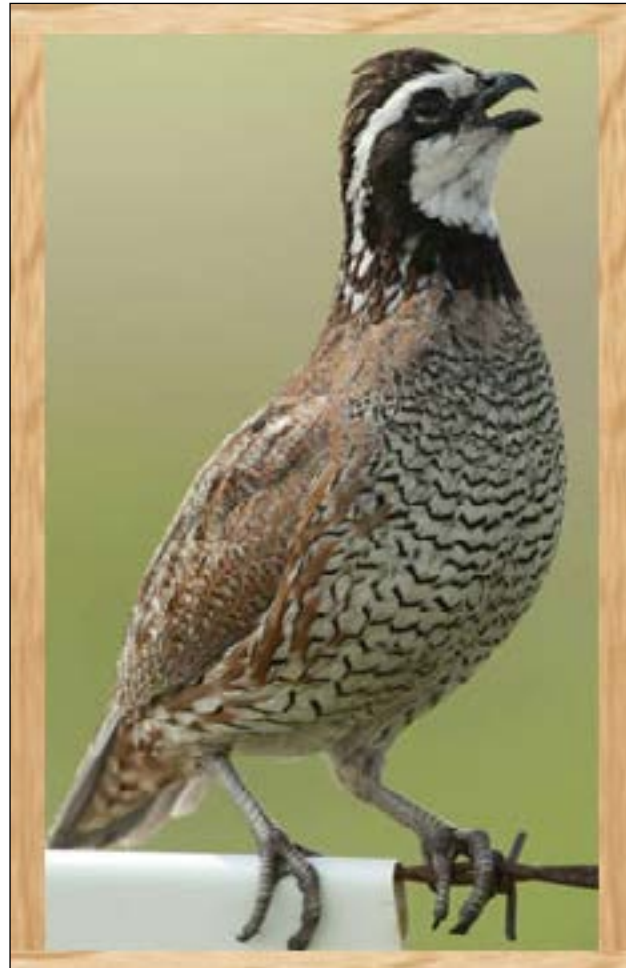
Bobwhite quail have almost disappeared but a program is in place to help in their restoration.

Growing up in the country, there were sights and sounds I became accustomed to never thinking these would ever fade from the landscape. There were birds we took for granted, birds that have seemed to fade away over the years. One is the shrike, or butcher-bird as we called them. They’re colored a lot like our mockingbirds but have totally different habits. Mockingbirds feed on insects, seeds and berries. Shrike feed on lizards, frogs and small rodents they catch with their hooked beaks and sometimes hang what they catch on the barbs of a fence to enjoy later. I have not seen one of these birds in years. Another is the meadow lark, a bird we knew as field lark. They sported a coat of mottled brown with a distinct golden chest marked by a black vee over the gold. They spend their time feeding on insects in fields and like to sit on fence posts with their distinctive whistle call. Again, this is another bird that has escaped my sight for the past several years. Another bird has all but disappeared. I’d love to be able to see a shrike or a meadow lark but I’d be super thrilled if I was out for a walk and heard the distinctive clear ringing “Bob