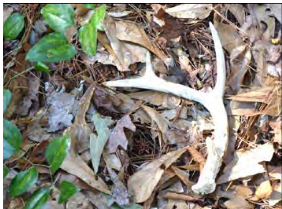
This is the time of year to begin searching for shed antlers as bucks drop them before beginning growing

Here's hoping your deer season was as successful as you hoped it would be. If you have been sitting down to meals of chicken-fried backstrap steaks or a tasty roast or found your breakfast of eggs tasting especially good with rounds or links of venison sausage on the side, you have for sure been successful. If you're anxiously waiting for a call from the taxidermist telling you the mount of your trophy is ready for pick-up and hanging on the wall, pat yourself on the back; it's been a good year for you. You may be having withdrawal symptoms now that season is over and you really wish you get to spend just one more frosty morning in a deer stand. You're not alone in this. Scores of hunters feel the same way. What can deer hunters do as a form of recovery to help you get over your addiction to chasing deer? Here's a suggestion – head for your woods and begin looking for shed antlers of the big buck you hunted all season but never showed up. Now that antlers are beginning to drop, the next several weeks offer the opportunity to locate sheds before the mice and squirrels begin gnawing on them. Here's what happens in the world of the deer. Buck deer drop their antlers in late winter or early spring. Soon after losing their headgear, they start growing a new set of antlers they'll have until this time next year. This new set begins as fuzzy knobs grow-