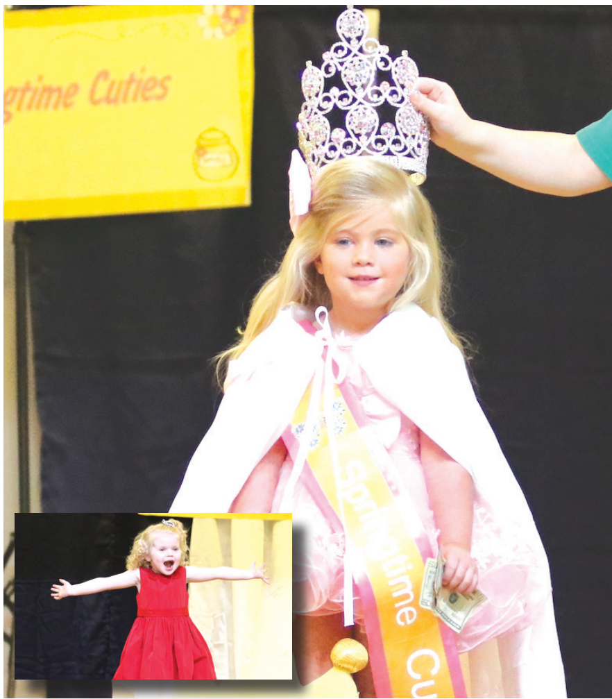
The 18th annual Springtime Cuties pageant, held at the Minden Community House on March 16, celebrated the beauty and poise of a bevy of young ladies.