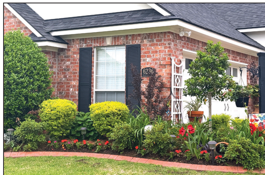
Added new shutters, address plaque and planted a Nellie R. Stevens Holly tree.