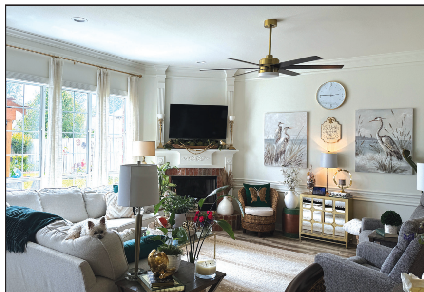
Keeping the room light and bright with the walls painted flat White Dove and the trim is semi-gloss.

Spring is the perfect time to spruce up your yard with new landscaping. If you maintain your own lawn, you'll be doing some spring cleanup anyway, removing dead leaves or stalks from perennial plants, pruning trees and shrubs, and preparing to fertilize. Once the last frost of the season has passed, you can