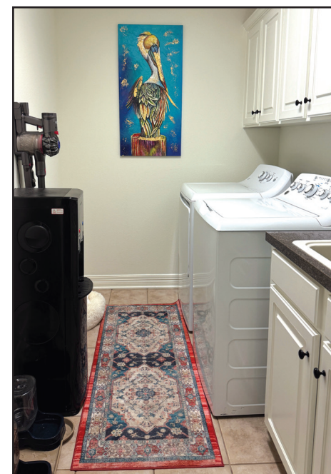
Don't forget the laundry room. Just add art and a rug!

If your home doesn't have a deck, spring is when you could build one. Wood is less expensive as a decking material, though it actually has a higher ROI (64.8%) than pricier composite materials (62.1%), according to Remodeling magazine's 2023 Cost versus Value Report. The only downside is that wood requires more maintenance. Harder woods such as redwood or cedar cost more, but they're more resistant to cracking, warping, and weather damage.