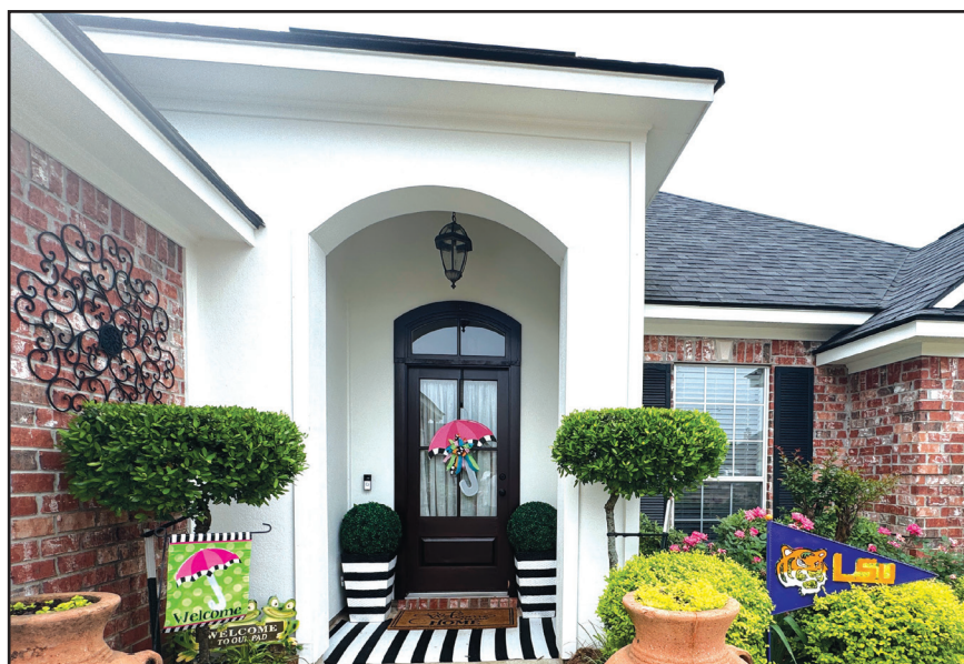
Stucco and trim are painted White Dove. Front door is stained walnut. Always have a welcoming entry and change your door decor seasonally.

Painting - particularly interior painting - can also be a fun and satisfying do-it-yourself (DIY) job. It requires no heavy equipment and has very few safety hazards. With some brushes, rollers, and painter's tape, the whole family can