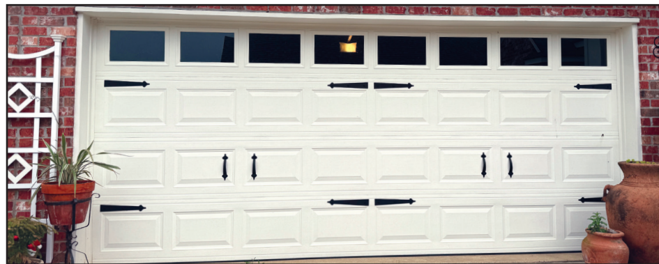
A very simple way to dress up your metal garage door is to add the magnetic handles and brackets.

Depending on the severity of winter and your home's age, you may have noticed that some windows have become drafty, allowing cold