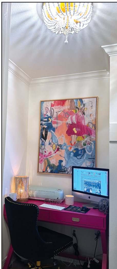
Make your home office a cheerful and a fun place to work.

Keeping your system free of dust and allergens can improve air quality and make