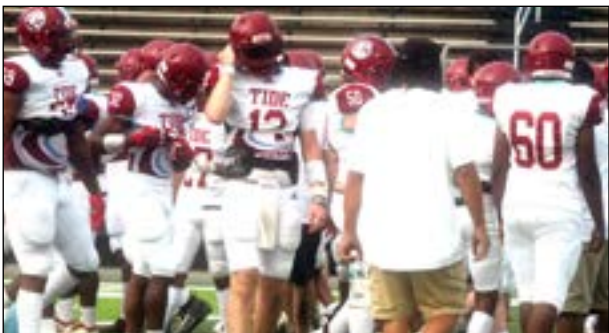
Minden players get ready to face Parkway in a scrimmage in May. The Tide was eligible to officially start fall practice Monday.

pected to be in high 90s and could reach 100 this week. That could alter practices.