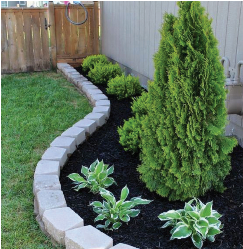
Small, easy to care for landscape.

their life are not yet ready to give up that association. Such persons will generally prefer moving to a smaller home with a small, but manageable landscape. As you plan your new landscape, try to choose plants that have been your favorites and preferably those that don't get too large. Should you like some of the plants in your former landscape that grew too big, look for dwarf or semi-dwarf varieties of the same species for your new landscape. Also, check for plants with more restricted lateral growth that will be a better fit for a smaller landscape. Keep lawn areas small because they are high maintenance and use too much of your time. Ground cover plants are a better selection than plants with a low profile.