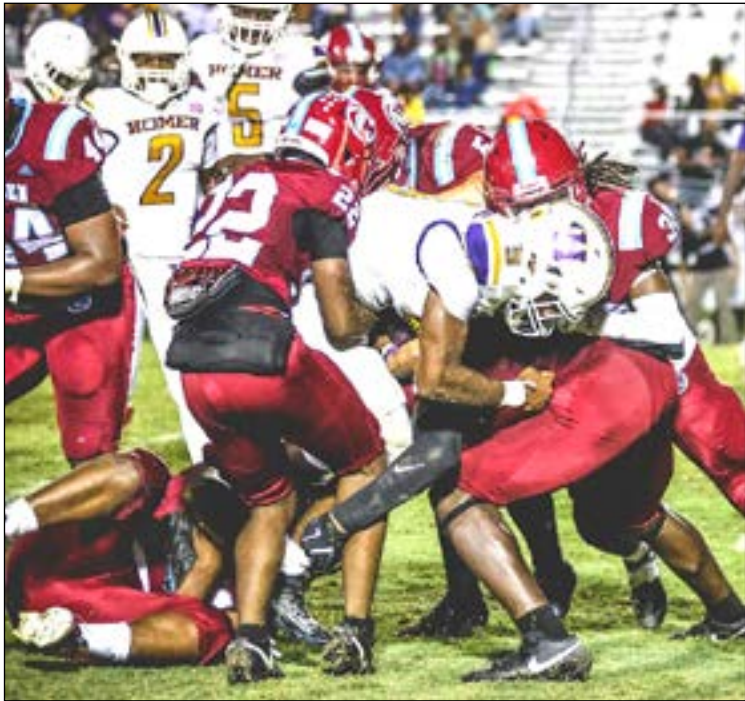
The Minden defense brings down a Homer running back during last week's victory