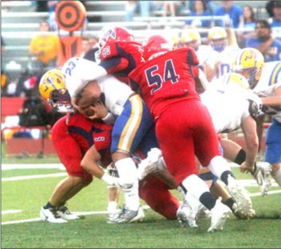
The Lakeside defense stops a LaSalle ballcarrier during last week's victory.