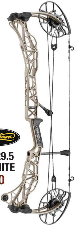
MATHEWS LIFT 29.5 RH 27.5/70 GRANITE $1229 00