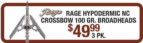
RAGE RAGE HYPODERMIC NC CROSSBOW 100 GR. BROADHEADS $49 99 3 PK.