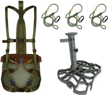
XOP EDGE PLATFORM & MONDO HYBRID HARNESS COMBO $199 99