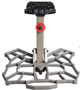
TROPHYLINE EDP PLATFORM $189 99