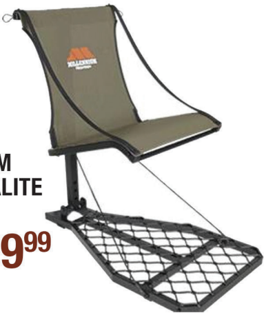
MILLENNIUM M100SL ULTRALITE HANG-ON $239 99