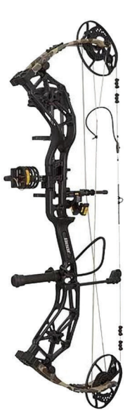
FRED BEAR ALASKAN XT RTH PACKAGE RH 60 THROWBACK BLACK $659 99