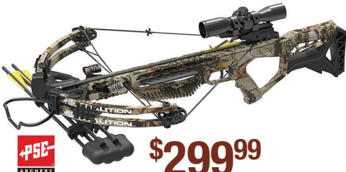
PSE COALITION CROSSBOW PKG. W/SCOPE AND BOLTS $299 99