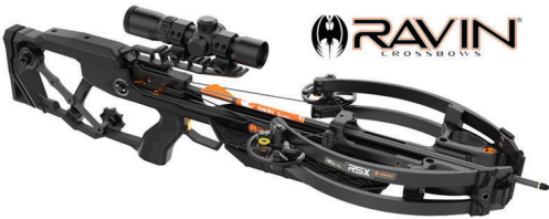
RAVIN R5X CROSSBOW $1399 99