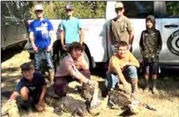
Seven youngsters enjoyed the fun of catching seven alligators as part of a Cross Trail Outfitters event held last week..