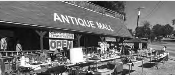
The Historical Highway 80 Sale took place once again this past weekend, with countless vendors setting up shop to sell all varieties of knick knacks along a shopping spree that spanned miles.