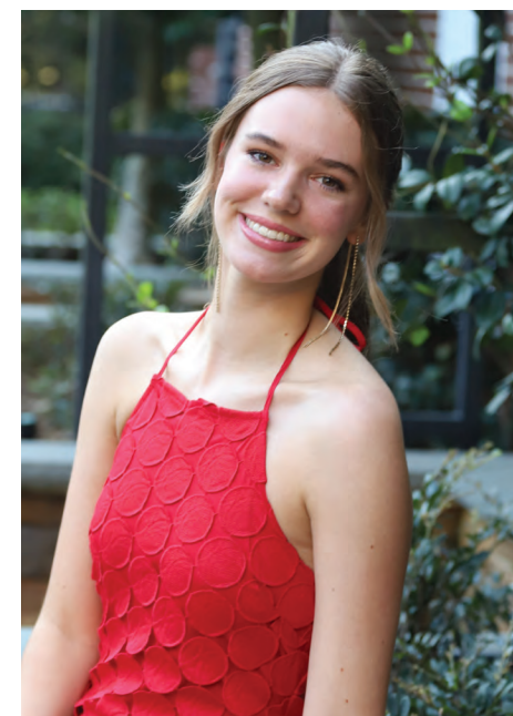
Princess Sophie Downer