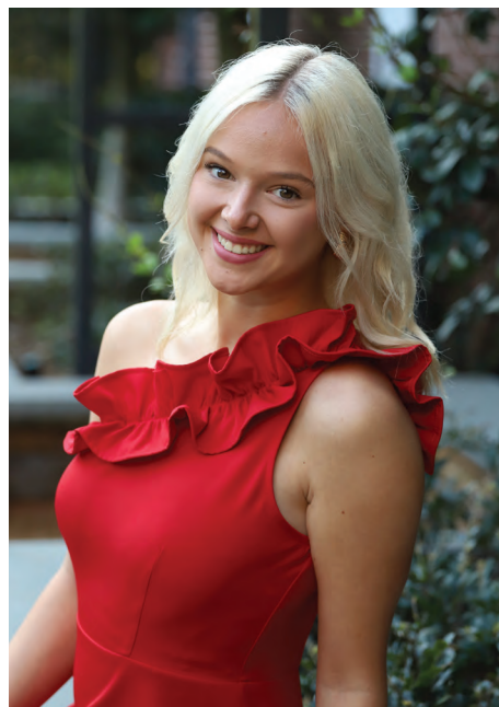
Spirit Princess Marley Black