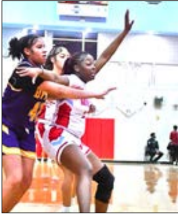
The Minden Lady Tiders picked up two victories last week.