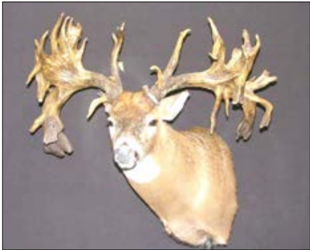
The "Hole in the Horn" buck found in 1940 is one of the most famous buck mounts ever collected.

Once we got to Springfield, my yearning for a breakfast sandwich got the best of me and I reluctantly pulled up to a drive-through of the same franchise as the one back home that had raised my hackles. To my surprise and delight, the servers were friendly – downright cheerful – and our orders were filled promptly and correctly. After nearly a week in Springfield, I learned that this is the way most folks are up there. We came away from every store; every hotel; every eatery with good feel-