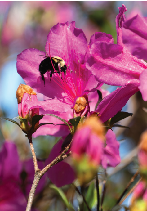
A bee visits an azalea bloom.