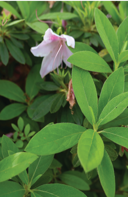
Azaleas have dense, evergreen foliage that provides year-round visual interest in the landscape.