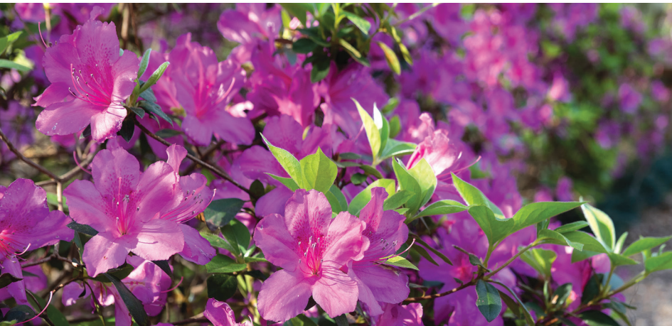
Lavender Formosa is a popular Southern Indica azalea cultivar.