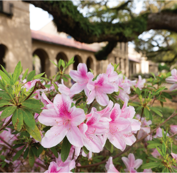
George L. Taber azaleas are found in abundance in the Quad on LSU’s campus in Baton Rouge.

Pruning is fairly easy and doesn’t need to be done every year. When it is time to prune, however, make sure to do it as soon as the bloom cycle is over. Azaleas set the next year’s blooms in summer, so pruning too late will eliminate most flower production for the following spring.