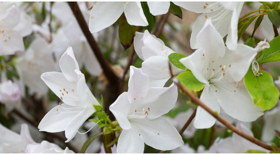
The white blooms of Mrs. G.G. Gerbing azaleas stand out in shady areas.