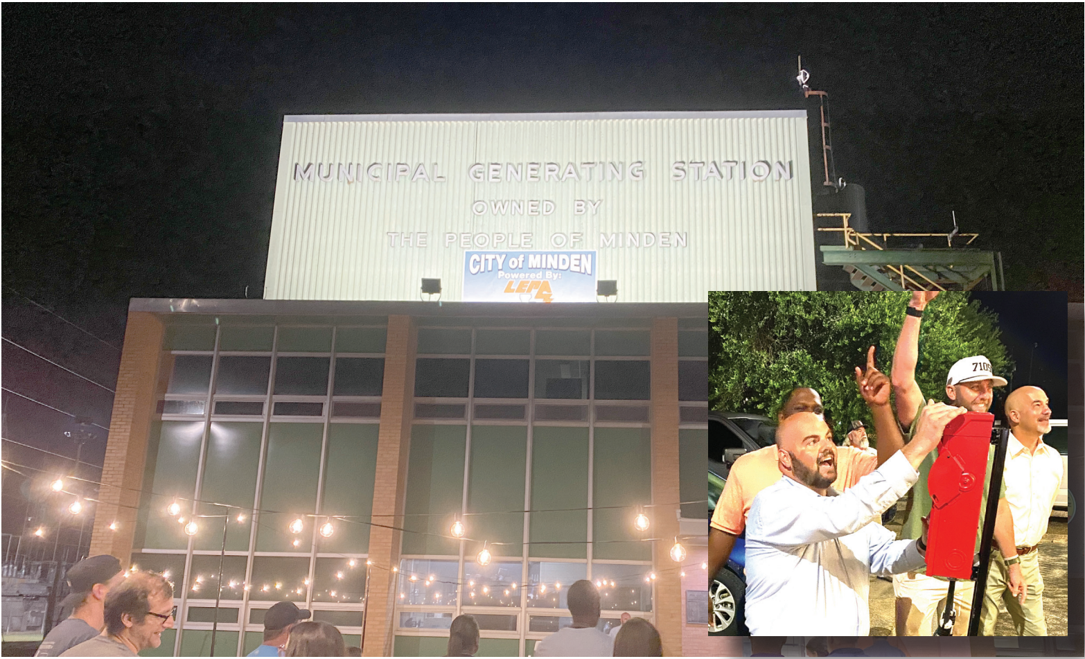
Mayor Nick Cox throws the ceremonial switch at the Minden Historic Steam Plant just before midnight on Saturday, marking the official start of the city's new power contract with the Louisiana Energy and Power Authority (LEPA) as a crowd of residents and city officials look on.

WEDNESDAY, JUNE 4, 2025 | $1.00 | MINDEN, LA | SERVING GOD & OUR COMMUNITY | VOL. 56 NO. 23 press-herald.com