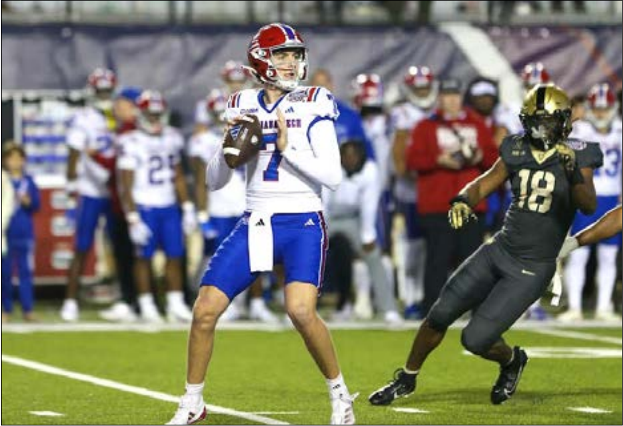
Louisiana Tech played Army in the 2024 Radiance Technologies Independence Bowl. The school announced the broadcast schedule and kickoff times for the 2025 season last week. The Bulldogs open the season at home against Southeastern Louisiana on Aug. 30.