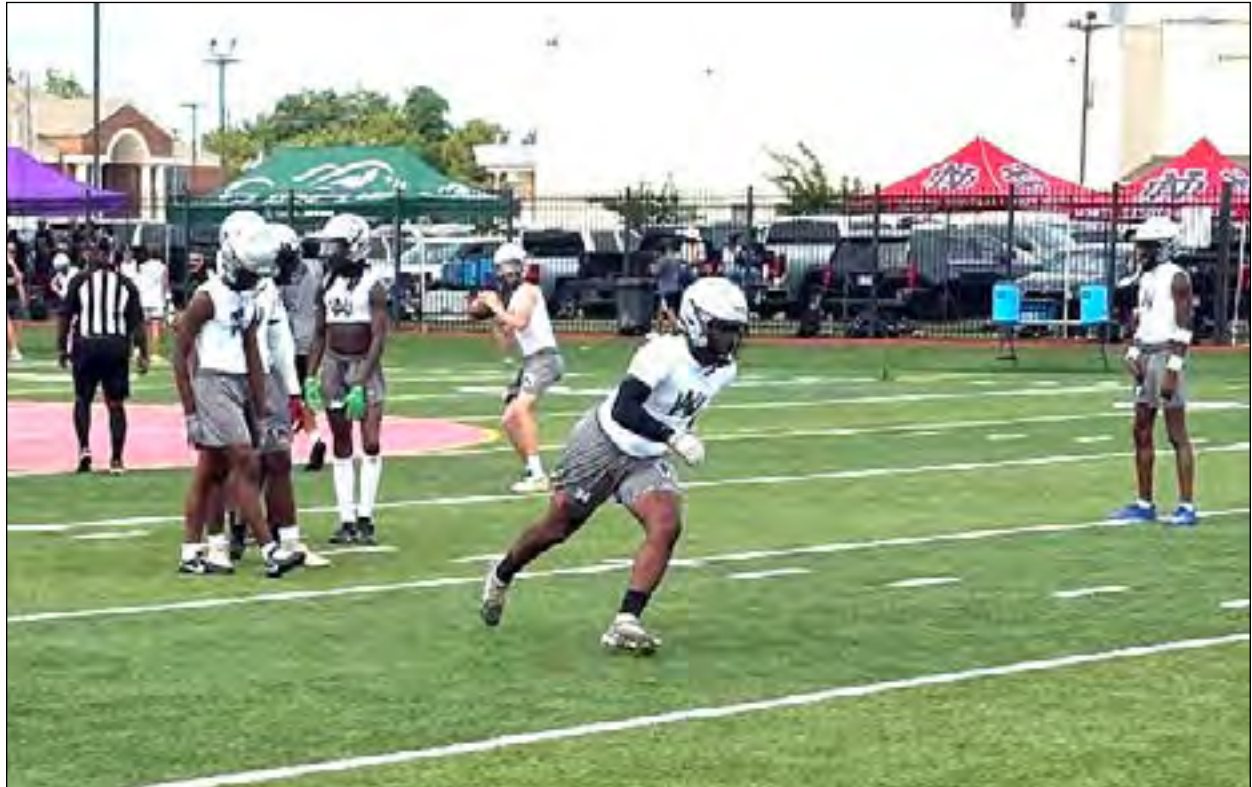
North Webster competed in the NWLA 7on7 Charity Invitational last Friday in Bossier City. The Knights are hosting the first Main Street Invitational 7v7 Tournament Saturday. Ten teams are scheduled to compete.