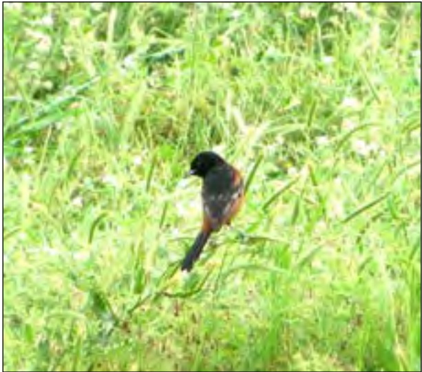
Boys with BB guns should never shoot songbirds, such as this beautiful orchard oriole.

I think of a good friend who lived outside Monroe, a dedicated hunter although he was confined to a wheelchair by a degenerative disease that later took