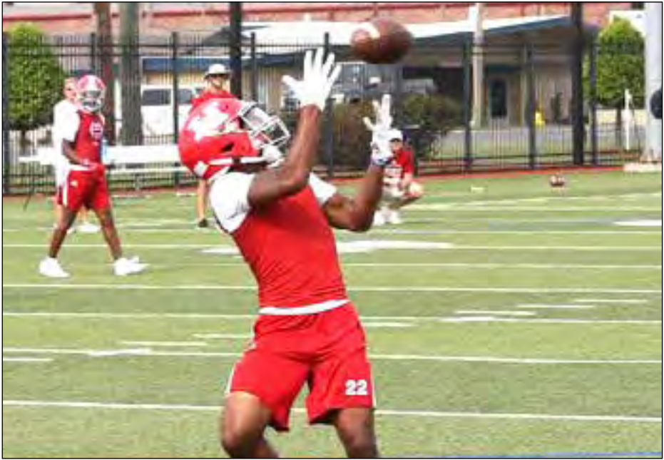
Haughton is among 10 teams scheduled to compete in the Main Street Invitational Saturday.

The games, which last about 20 minutes, are generally played on a 40-yard field. First downs can be made by reaching the 25 and 10.