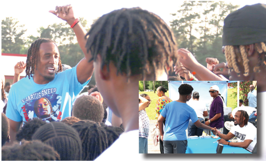
L’Jarius Sneed speaks to participants during his youth football camp at Minden High School on Friday, part of a weekend of community events hosted by the NFL star and Minden native.

Community members of all ages came out to celebrate hometown NFL star L’Jarius Sneed during a three-day weekend of events in Minden, which included a health fair, youth football camp, and car show with a basketball tournament. The weekend kicked off Thursday with the Game Plan for Health event at David Raines Community Health Center. Nearly 100 people received wellness checks, sports physicals, and free food. Friday’s youth football camp at Minden High School drew a large crowd. Before the camp began, one of the coaches told attendees that Sneed had been called back to NFL training camp and wouldn’t make it. Moments later, Sneed surprised the kids by ap-