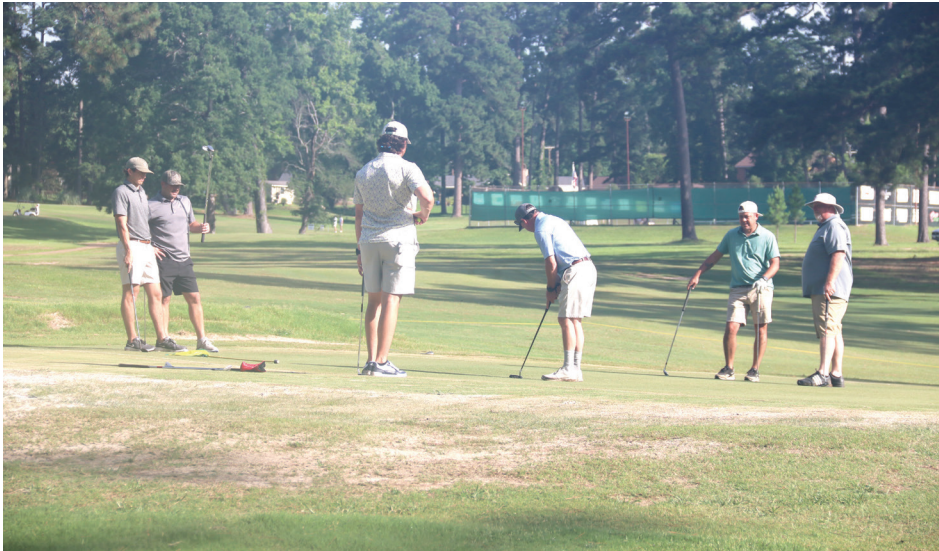
Golfers gather at Pine Hills Country Club during the 2025 UCAP Charity Golf Tournament, one of the organization’s largest fundraisers supporting assistance programs for the Minden community.